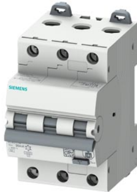
RCBO, 6 kA, 3P Type A, 300mA, C-Char, In: 16A Un: 400V