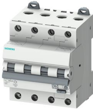
RCBO, 6 kA, 4P Type A, 30 mA, C-Char, In: 32A Un: 400V