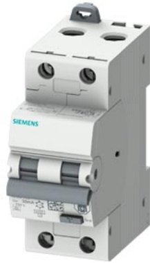
RCBO, 6 kA, 2P Type A, 30 mA, B-Char, In: 25A Un: 230V