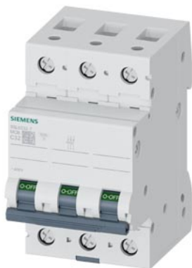
Miniature circuit breaker 400 V 6kA, 3-pole, C, 32 A