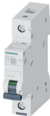
Miniature circuit breaker 230/400 V 6kA, 1-pole, C, 10 A