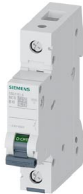
Miniature circuit breaker 230/400 V 6kA, 1-pole, B, 10 A