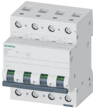
Miniature circuit breaker 400 V 10kA, 3+N-pole, C, 20 A