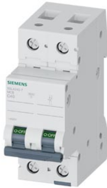
Miniature circuit breaker 400 V 10kA, 2-pole, C, 40 A