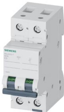
Miniature circuit breaker 400 V 10kA, 2-pole, C, 3A