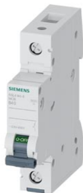
Miniature circuit breaker 230/400 V 10kA, 1-pole, B, 40 A