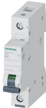
Miniature circuit breaker 230/400 V 10kA, 1-pole, B, 20 A