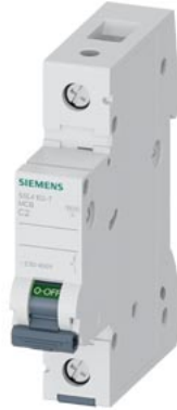
Miniature circuit breaker 230/400 V 10kA, 1-pole, C, 2A