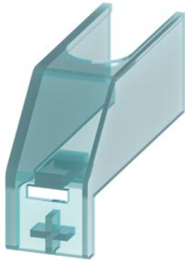
Terminal cover, for 1-pole, Accessories for load disconnecter 3LD3