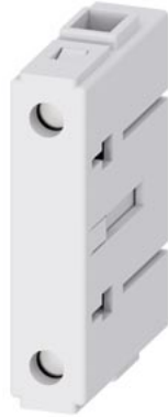
N-through terminal, Floor installation accessory for Load disconnecter 3LD3